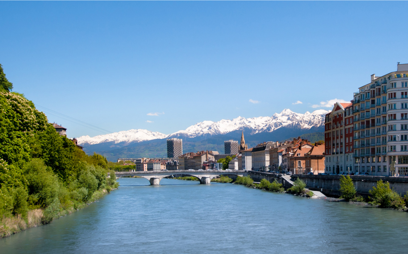
Grenoble city center