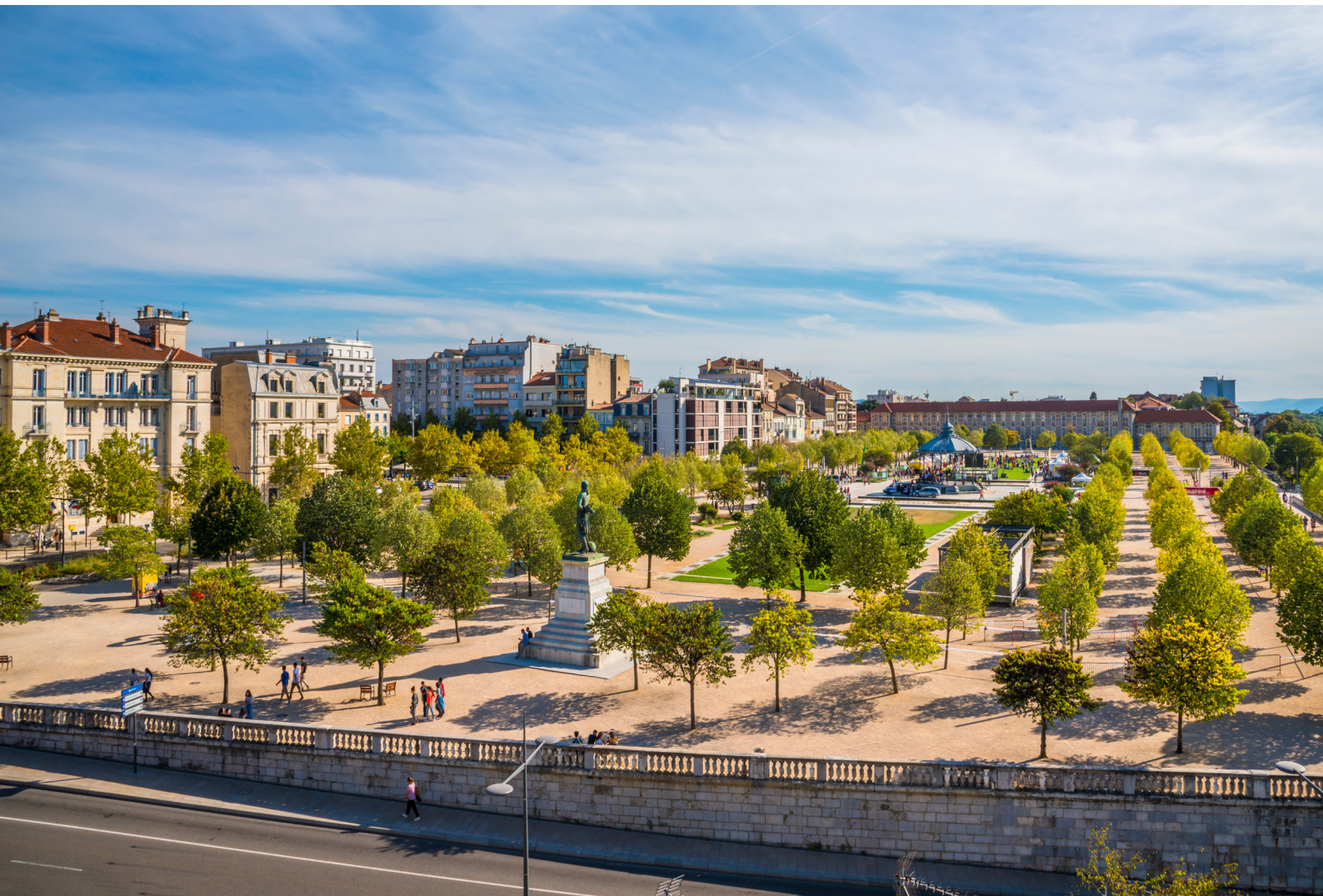
Valence city center