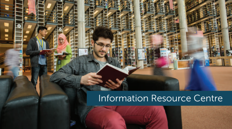
Information Resource Centre