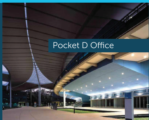
Pocket D Office